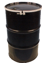
55 Gallon Drum